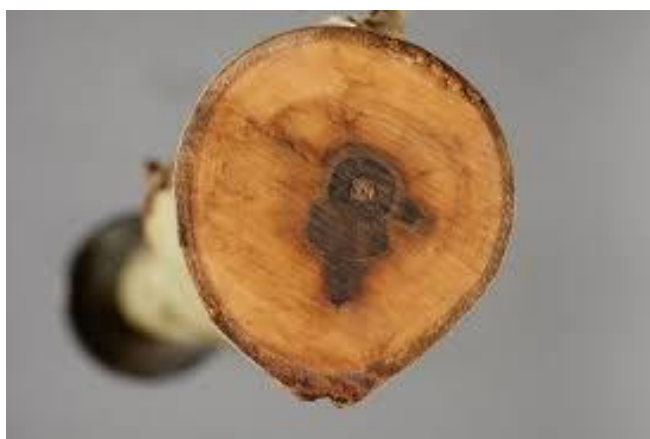
Ash dieback seen above in the cutaway section of a tree trunk

Getting a reliable stock of ash has therefore been an issue for hurl-makers due not only to the disease but with problems exacerbated by global uncertainty, competition for supply and rising shipping costs. Approximately 80% of the planks for hurls are currently imported from the UK, Croatia, Slovakia, Denmark and Sweden. A significant proportion of the supply was also being imported from Ukraine by a number of hurl makers involved in mass production. That supply has now been disrupted due to the war. Despite the large number of ash trees suitable for hurl making across Europe, ash dieback disease may be found wherever ash trees grow which affects supply.