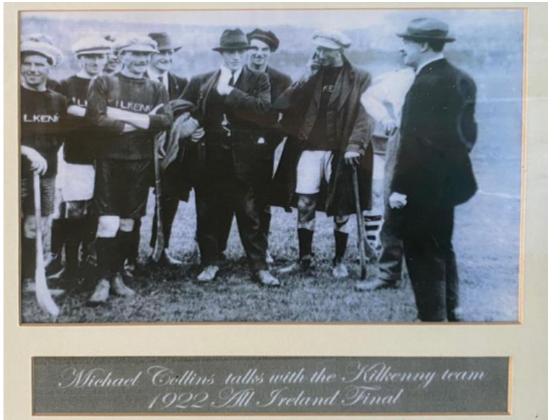
Michael Collins talks with the Kilkenny team 1922 All Ireland Final