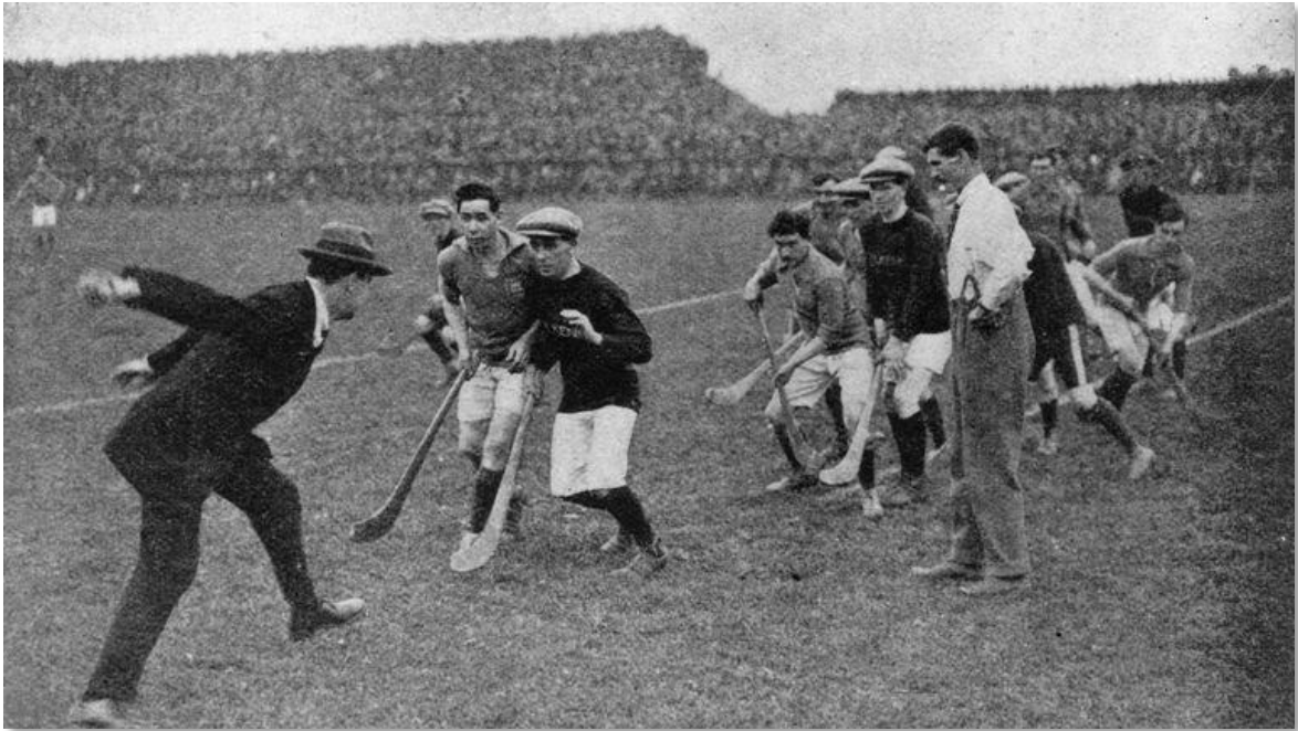
Michael Collins throws in the ball to start the 1921 Kilkenny V Dublin Leinster Final. Same opposition this year except Kilkenny were the victors!