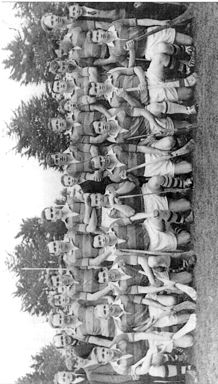
Bennettsbridge – Kilkenny Senior Hurling Champions 1964