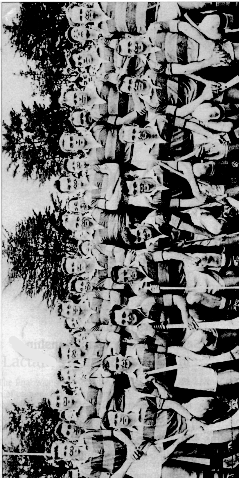
Bennettsbridge – Kilkenny Senior Hurling Champions 1962