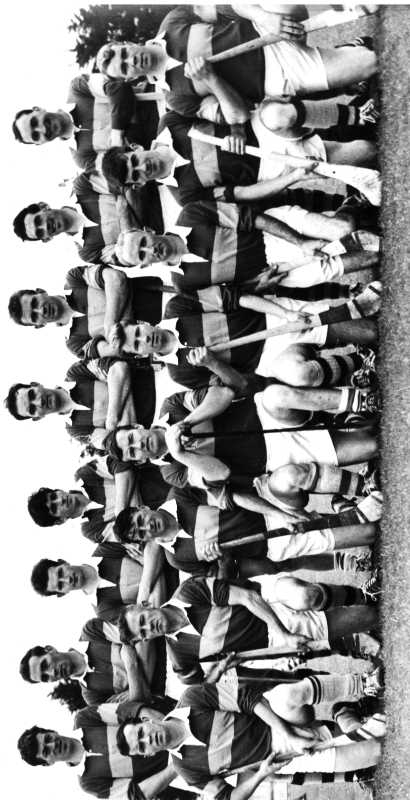
Bennettsbridge – Kilkenny Senior Hurling Champions 1966